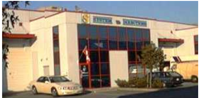
SDL Head Office